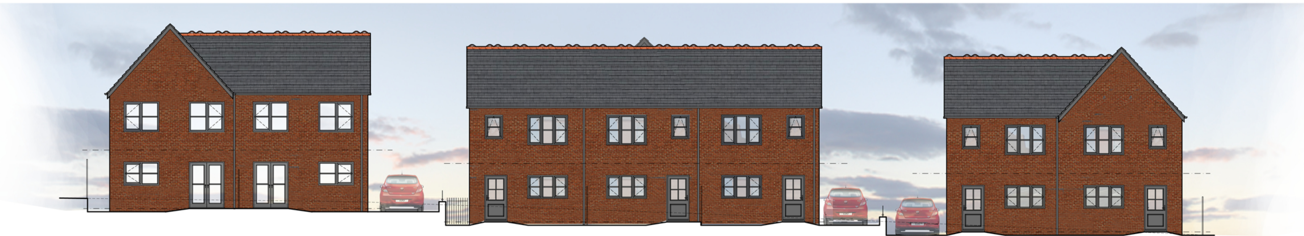
Mews Court Rear Elevation