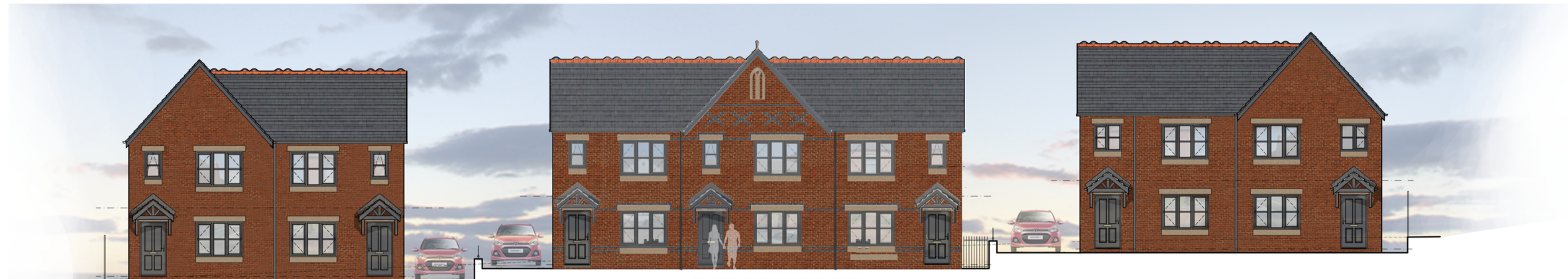
Mews Court Front Elevation