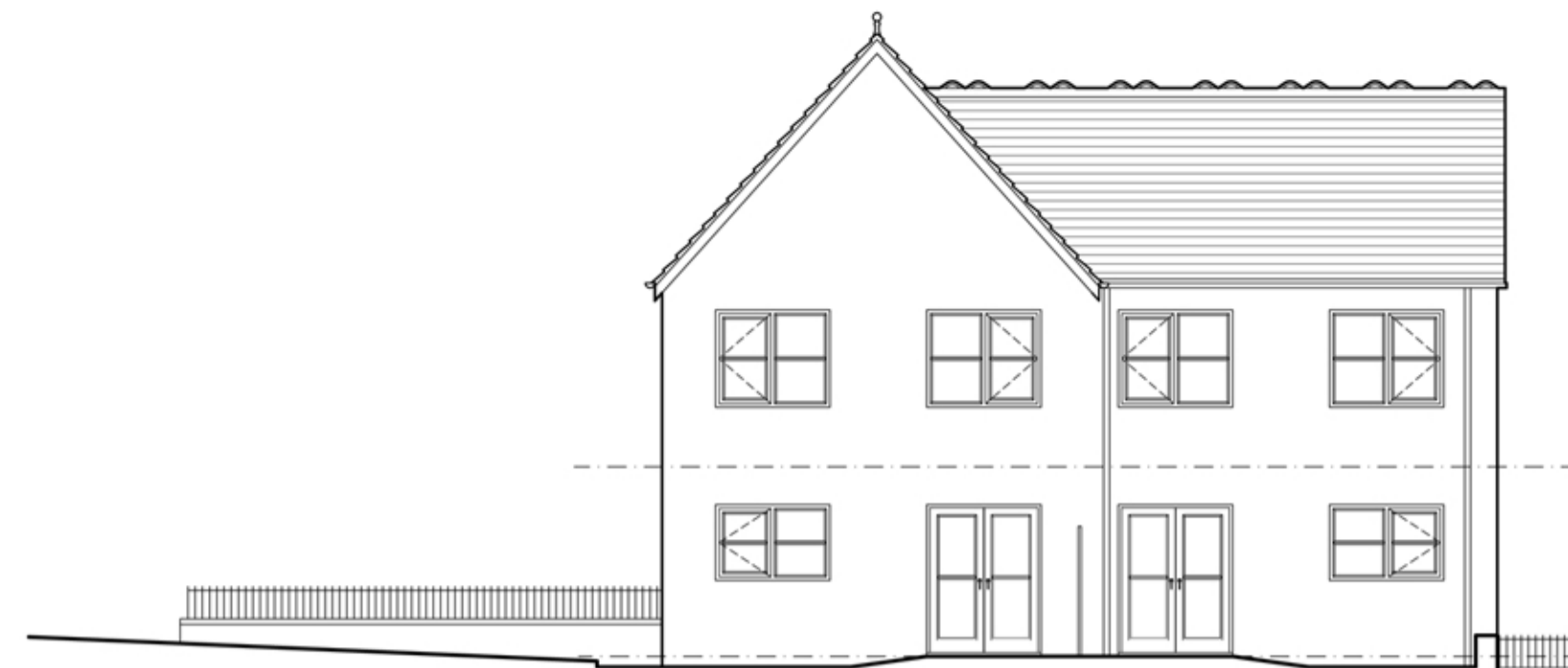
Mold Road Rear Elevation